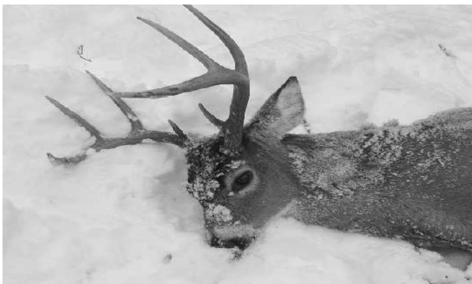
Bernie Young took this beautiful buck during muzzle loading season.